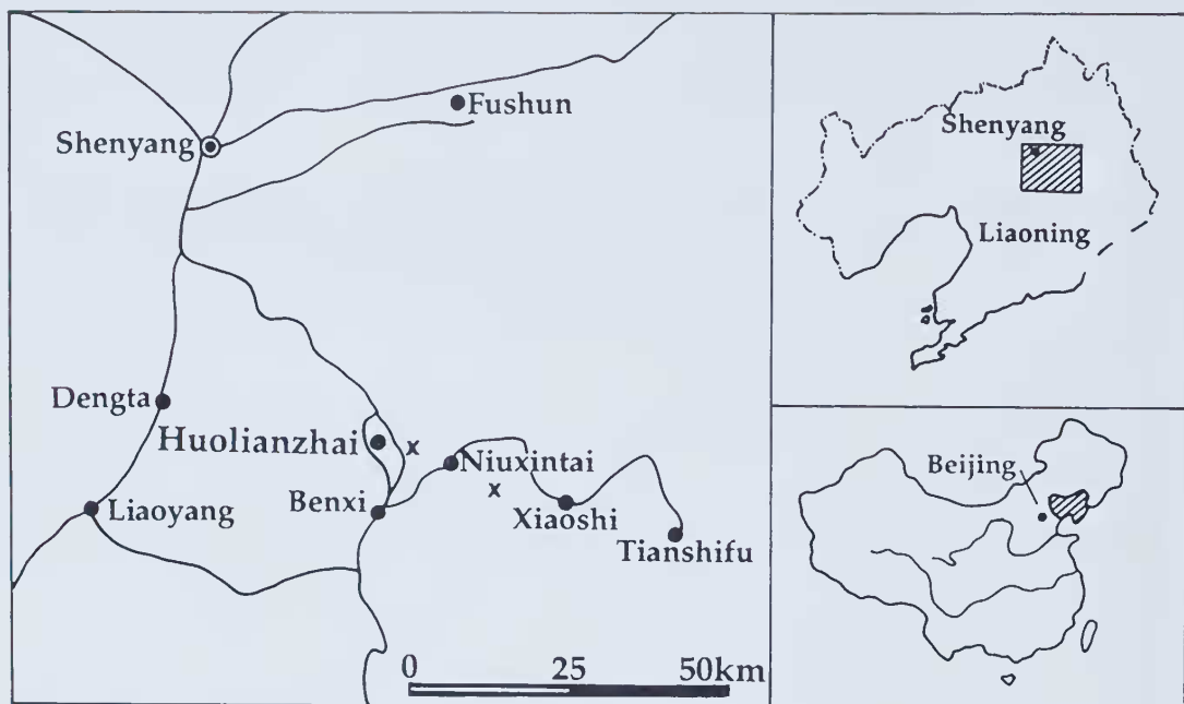
Figure 1 Sketch map showing the two fossil localities.

The fauna contains characteristic fossils of the Upper Cambrian which is widely distributed in the Upper Cambrian of Shandong, Anhui, and Zhejiang Provinces (Lu, 1962; Chen et al. , 1979; Chen and Teichert, 1983; Chen et al. , 1983).